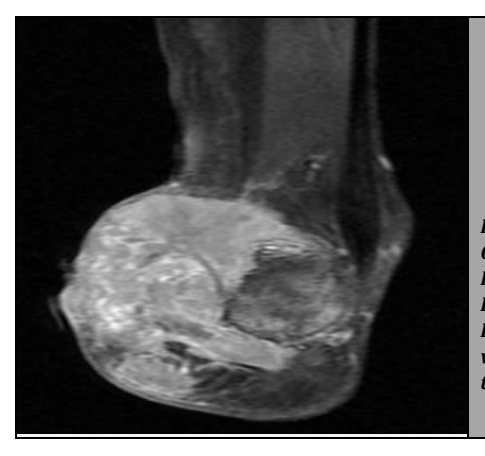
Figure 1. Coronal T1 + C Image Showing Intensely Enhancing Lesion with Extension in the Calcaneus

A provisional diagnosis of recurrent DFSP with local extension into the bone was made. The lesion was resected with below knee amputation and the sample was sent for histopathological examination which showed an ulcerative growth on the proximal margin with an unremarkable epithelial lining and the deeper tissues were composed of fibro collagenous adipose stroma. The distal margin of the specimen was outlined by hypertrophied squamous epithelium with keratosis and the deeper tissue was similar as proximal containing fibro collagenous in nature with prominent vasculature.