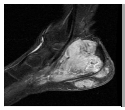
Figure 2. Sagittal T1 + C Image of the Lesion with Involvement of the Fat Pad